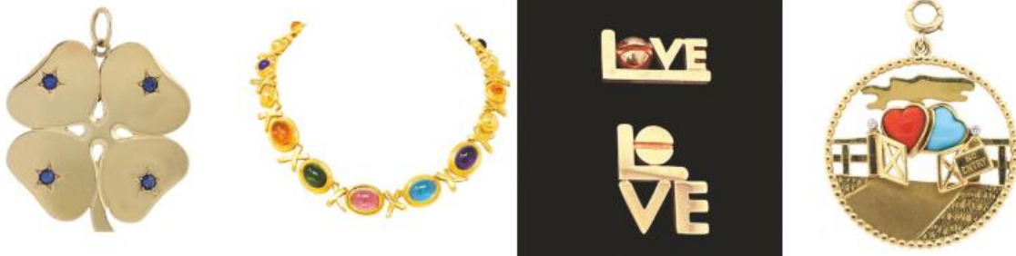
(Exhibitors Featured from Left to Right: Rogue Jewels, Wilson's Estate Jewelry, Circa 1700, and Keyamour)

January 8-11, 2026 • Hyatt Regency Miami